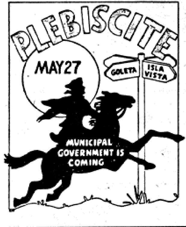
Poster for the May 1975 Plebiscite Graphic design by Mike Gold