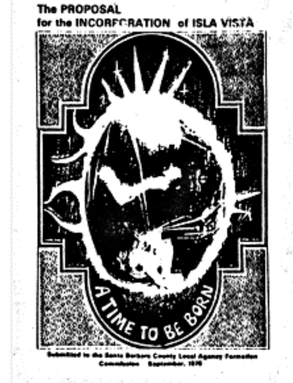
1975 Isla Vista Cityhood Proposal Cover graphic by Mike Gold based on a concept by Arthur Longoria