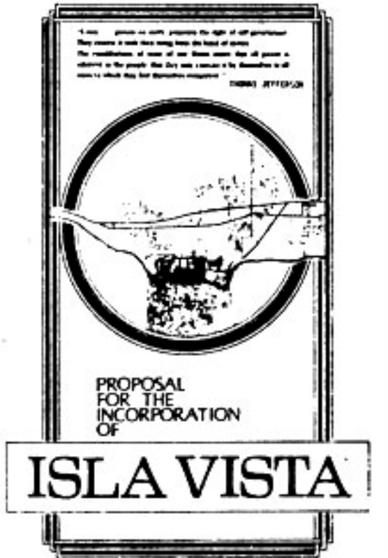
1973 Isla Vista Cityhood Proposal Cover graphic by Al Plyley